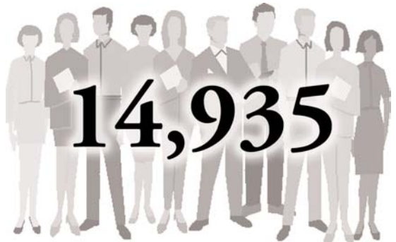
Figure 2: Impact on personal income

Hospitals directly and secondarily employ 14,935 workers in the Rockford area, making hospitals one of the largest sources of employment in the city.